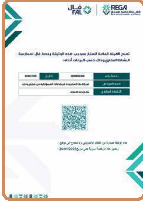
Fal Property Management License