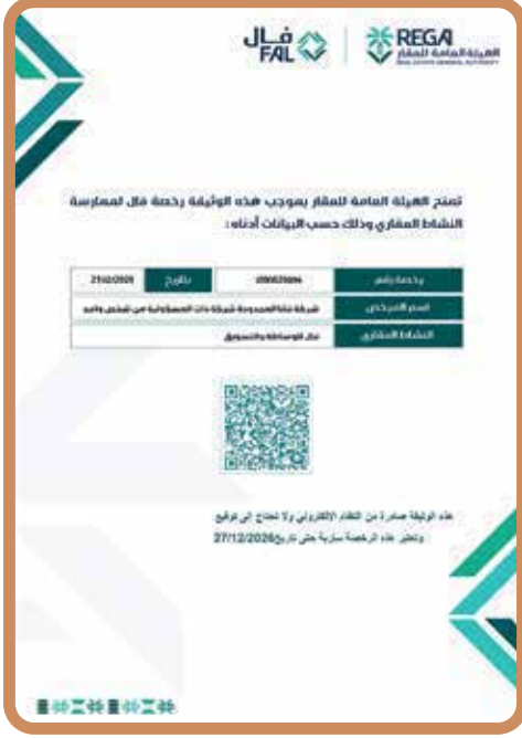
Fal Real Estate Brokerage License