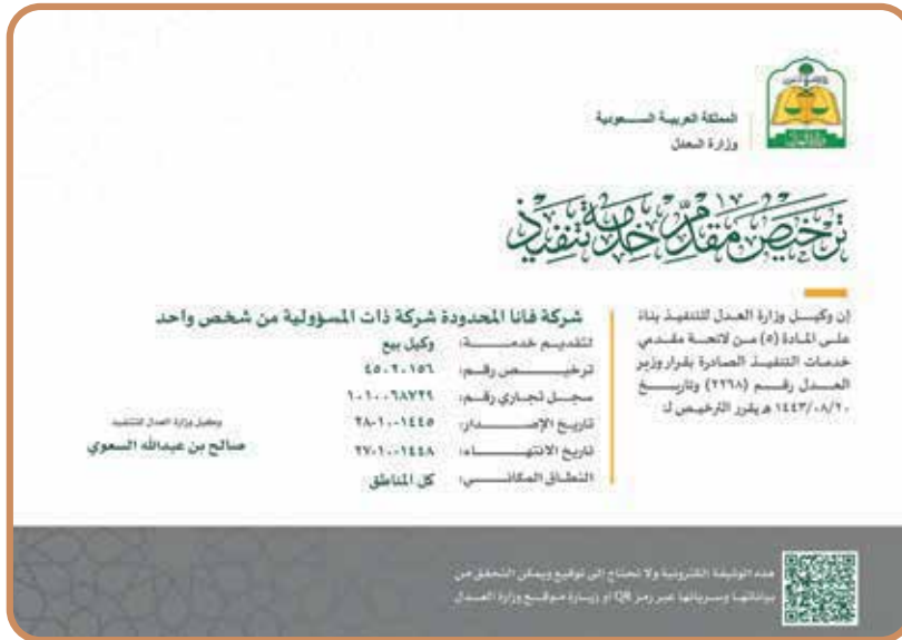
Judicial Sales Agent License