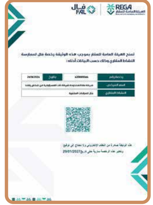
Fal Auction License